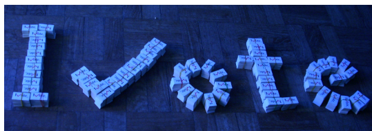
Stickers arranged on the floor

With regard to the elections, Nay Win Maung informed me about the big scheme of educating party members and help to create networks, particularly among and between ethnic group. The big aim was to contribute to creating an atmosphere for a mutual understanding and peace negotiations to end the civil war. Quite obviously however, the emotional engagement of the Egress