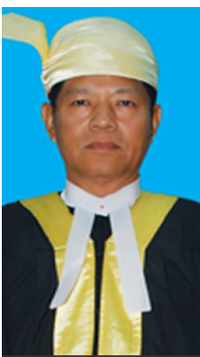
Thein Soe

According to section 25 the of Parties Registration Law enacted by the SPDC in March 2010, all still existing parties had to apply to the Election Commission within 60 days and needed the permission to continue activities and participate in the forthcoming elections. 10