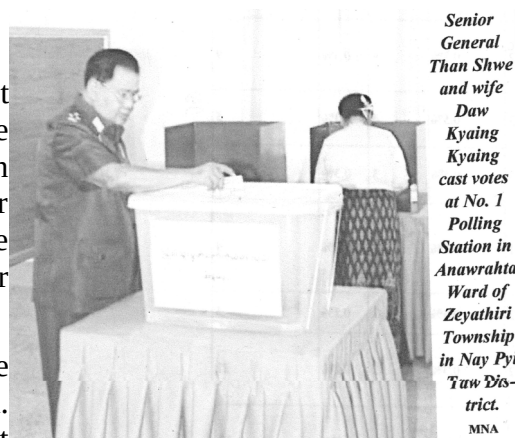
Senior General Than Shwe and wife Daw Kyaing cast votes at No. 1 Polling Station in Anawrahta Ward of Zeyathiri Township in Nay Pyi Taw District.

With regard to the parties filing candidates countrywide, it is remarkable that the National Unity Party that succeeded the Burma Socialist Programme Party in 1988 not only fielded almost 1,000 candidates, but won quite a number of seats and even more the National Democratic Front that had split off the NLD. Local observers argued that the strength of the party was connected that many