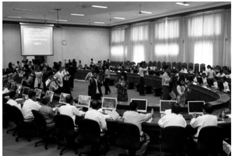
Election Commission meeting

93 parties had contested the 1990 elections, down from the 234 that had been registered until end of January 1990. After the adoption of the 2008 constitution, ten were still left. Most of the parties had been de-registered on formal reasons because they lacked a proper organisation, some disbanded and a few were thrown out because of "treasonous activities" like Sein Win's NDP after the foundation of the NCGUB in December 1990. Among the still existing parties were the NLD, the NDP and the most successful ethnic party the SNLD (ICG 2009: 6, fn. 26).