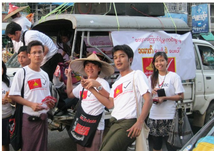
Young NDF supporters on election day

Obviously, the NLD's decision was not approved by all party members and supporters.. Some weeks after the NLD had been de-registered on May 6, 2010, party members of the NLD among them members of the Executive Council, applied for registering a new party with the Election