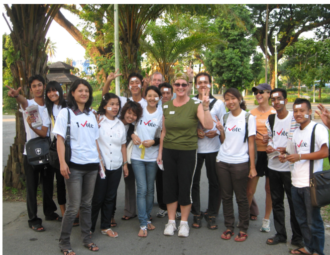
Myanmar Egress students and two foreigners (last row: the authors) at the end of the I-vote campaign at Kandawgyi Lake